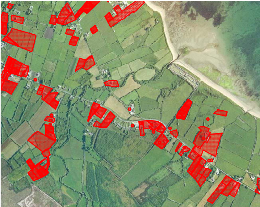
Development Pressure 1999 to 2007

Aughacashla is a dispersed rural settlement area. There is no public waste water treatment facility in Aughacashla. A preliminary report has been prepared although this infrastructure is unlikely to be provided within the lifetime of this plan. Given the lack of any facilities in the area and the absence of an existing village/settlement structure, the need to prioritise investment into existing settlements and the existence of the regional centre of Tralee 19km away, it is not intended to develop a new village settlement in Aughacashla. Development potential for the area is very limited and it is the strategy of the plan that applications for development in the area will be dealt with in accordance with the rural policies of the current Kerry County Development Plan.