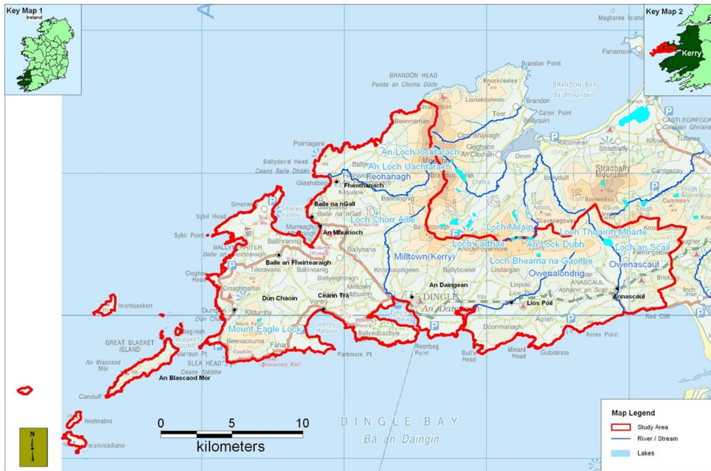
Figure 3.3: Main Surface Water Features and Settlements located within the Plan Area