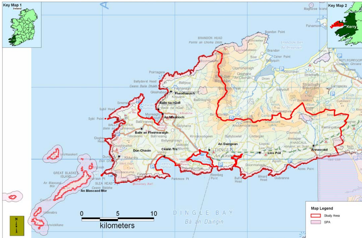
Figure 3.2: Special Protected Areas including proposed Special Protected Areas